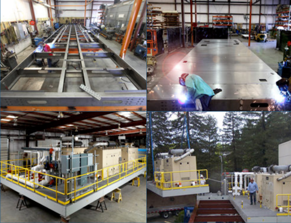
Hospital reduces energy costs, carbon footprint with combined heat and power.

Modules provide low-emission, high-efficiency heating and power solutions to this 259-bed acute care facility.