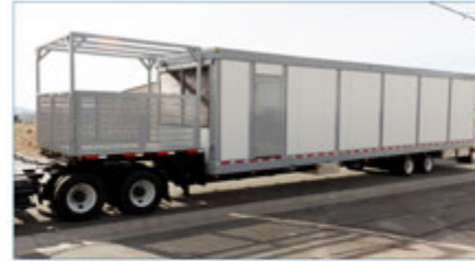
Eaton UPS Backup System 1200 kW Mobile Rental Trailer on the way to Super Bowl