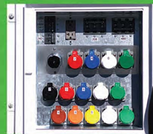
Single-Phase (110/240V) and Three-Phase (208/240/480V) Receptacle Outlets All voltages are available simultaneously