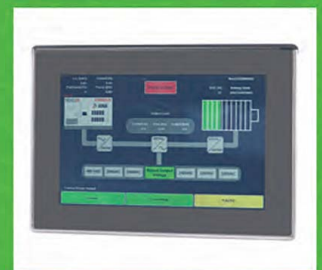
Touchscreen Control Panel Large 10" display