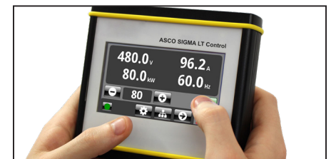
Optional SIGMA LT Hand-Held Controller.