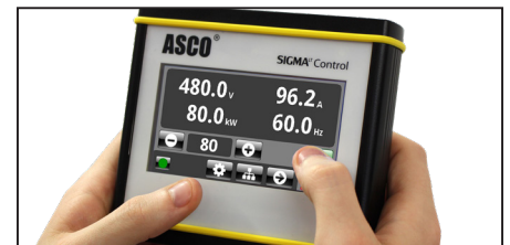
Optional SIGMA LT Hand-Held Terminal.