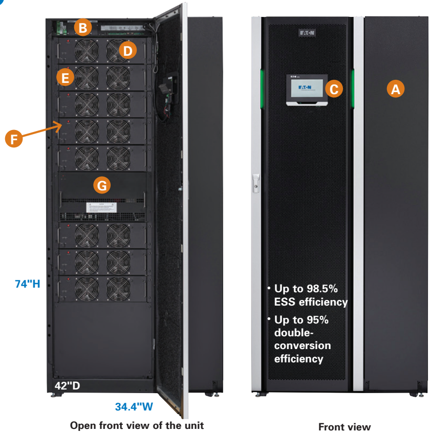
Open front view of the unit