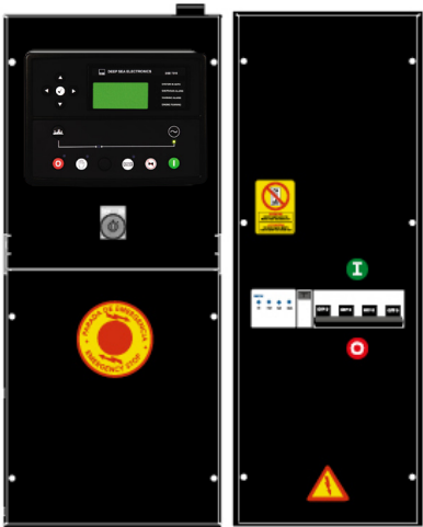
Pictures of Control Panel RH and Distribution Panel LH may include optional equipment and/or accessories

Alternator alarms included: Overload, unbalanced voltage, over voltage, under voltage, over frequency, under frequency, short circuit, reverse power, and incorrect phase sequence.