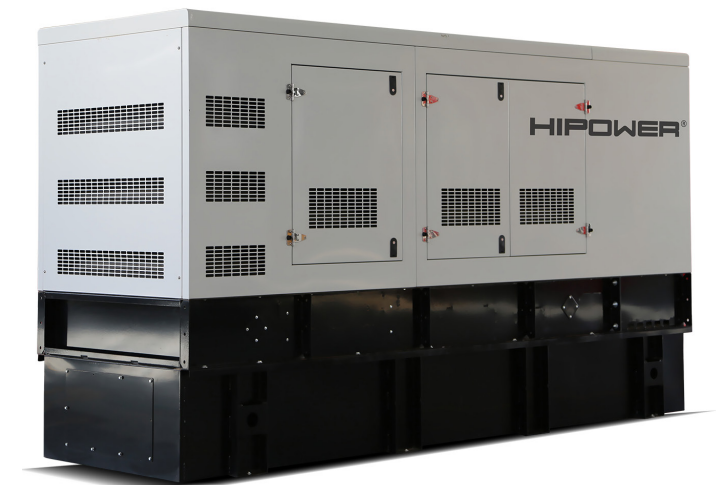
Generator depicted with sound attenuated option, some accessories for display only.