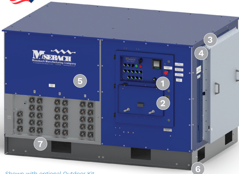
Shown with optional Outdoor Kit

Mosebach XL1500 series of resistive load banks are designed for testing power supplies up to 1500kW of various voltages. The XL series is designed for continuous use in the harshest climates and environments.