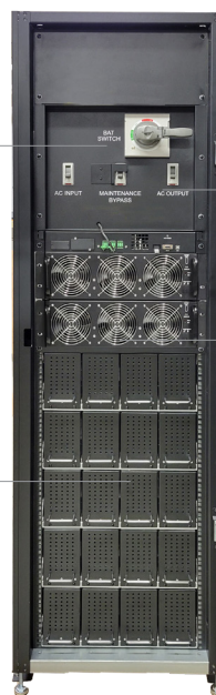
X90-2S 100kW UPS (door removed)

Battery Module includes 10 pieces of 12V 580W batteries